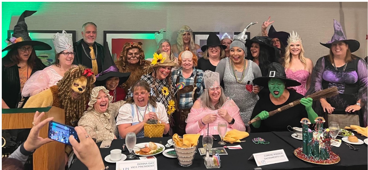
Wizard of Oz Costumes - Saturday night banquet